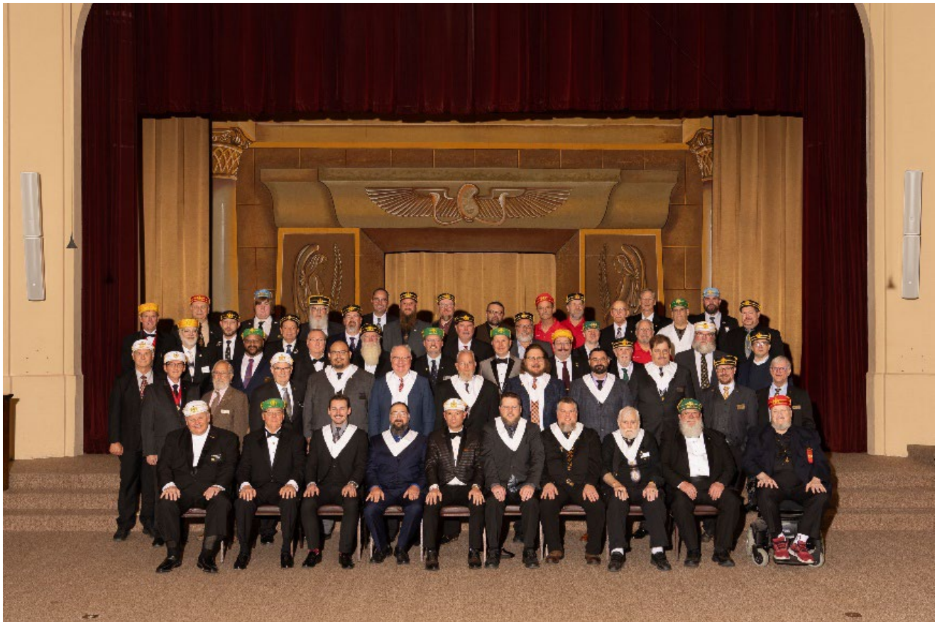
FALL REUNION CLASS 2024