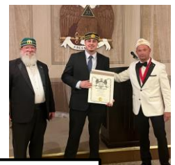
Additional certificates for members of the 2022 Fall Class