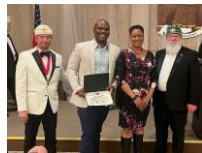
Class members receiving Scottish Rite certificates