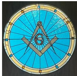
Stained window from the old building