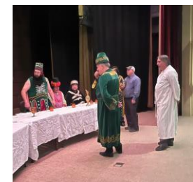
Final instructions and run-throughs before a degree is presented