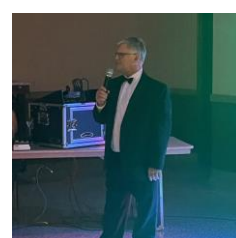
4 Past CICs and the Current CIC were in attendance at the Spring Reunion Banquet