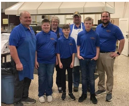
Demolay provided the lunch