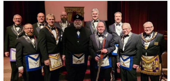
EA Degree Cast