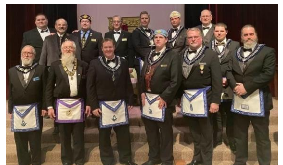
MM Degree Cast