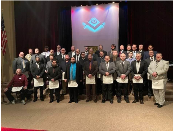
New Master Masons

The Valley of Eau Claire raised 38 new Master Masons that day. Congratulations to all of the new Brothers!