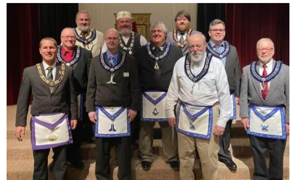
FC Degree Cast